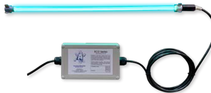
ECO (budget friendly) series kits come standard with fully enclosed electronics and standard output 1 year lamp