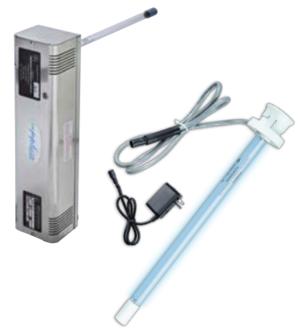
Sapphire and Eliminator (light commercial residential line) come standard with a 2 year "GREEN" High-Output lamp(s)