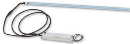
PEK/GTLK (commercial/industrial) series kits come standard with High-Output lamps GSL, GTL, or GCL series lamps

These kits are offered in five lamp lengths (18", 24", 36", 48", & 60") fully wired electronic ballast with moisture proof lamp connector(s) spring clip lamp-holders, "GREEN UVC lamp(s) 120-277 v 50/60 Hz - 10-year non-prorated ballast warranty, ballasts are UL listed.