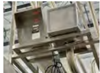
BT-8-120 Sterile Conditioner with LTX-14 Tank Vent