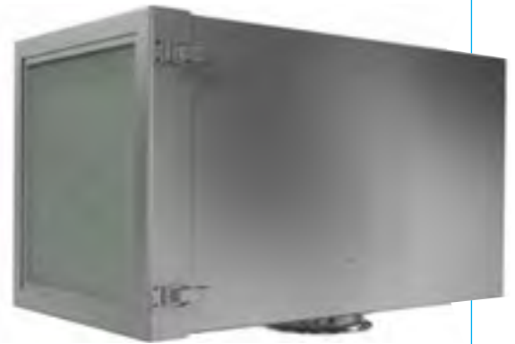
LTX Tank Vent

The LTX Series Tank Vent standard filter package includes two 10 micron electrostatic filters and one 0.3 micron HEPA filter. American Ultraviolet can also provide virtually any size and type of tank connection fitting for our tank vents.