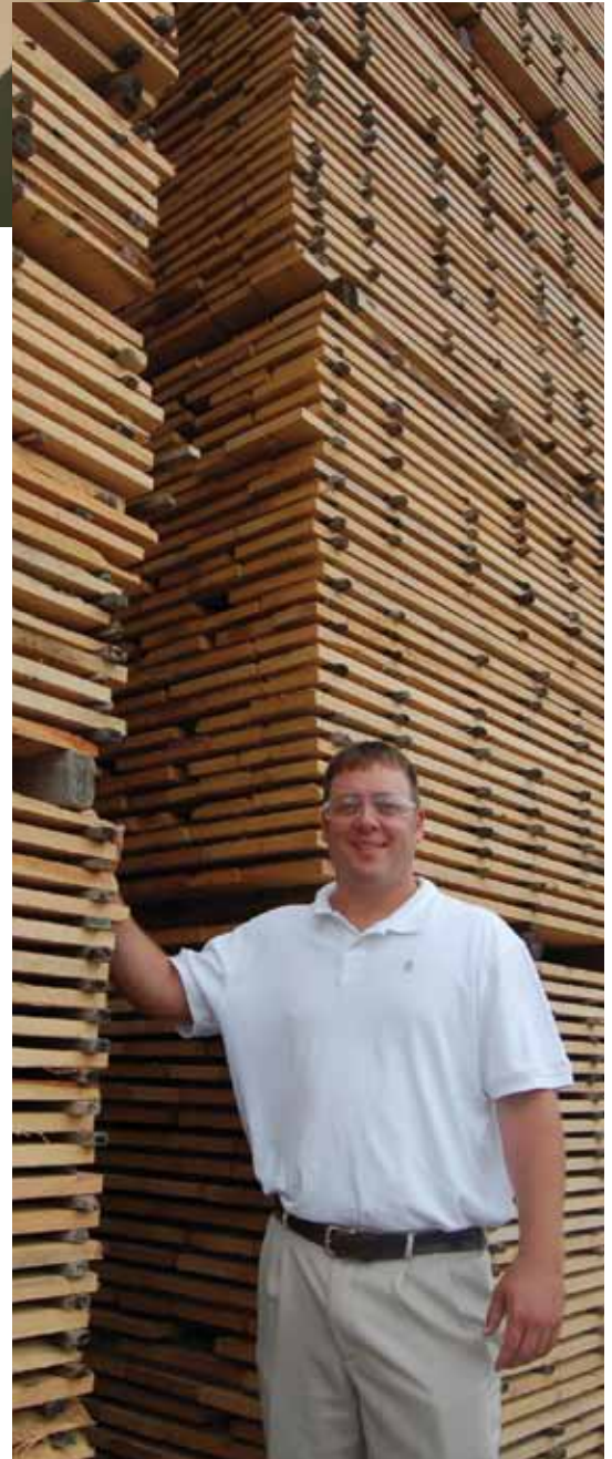
Caption can go here.

Now the stockyard of their 16-acre plant in East Berlin, Penn., is stacked sky-high with nearly every