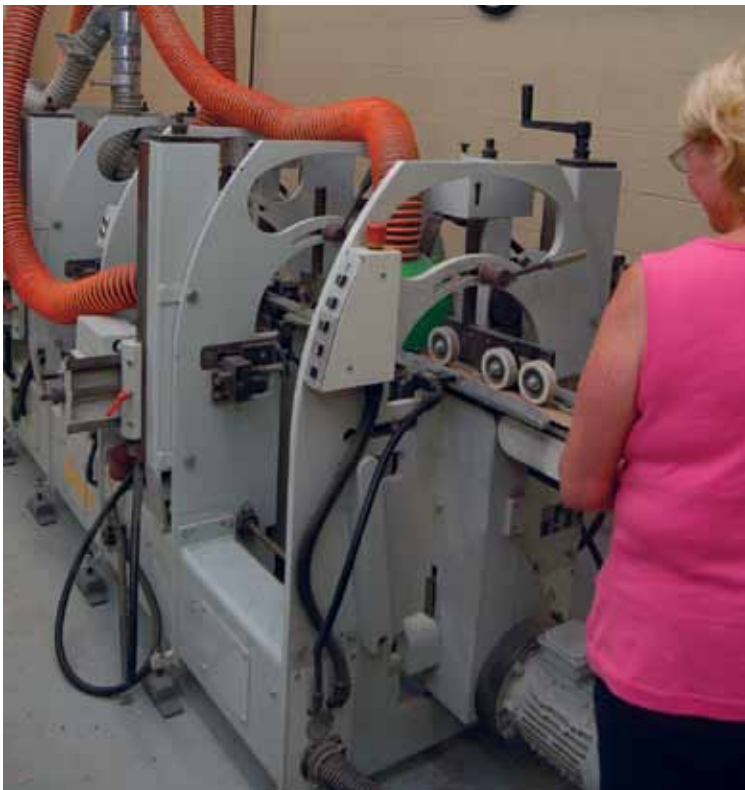
Caption can go here.