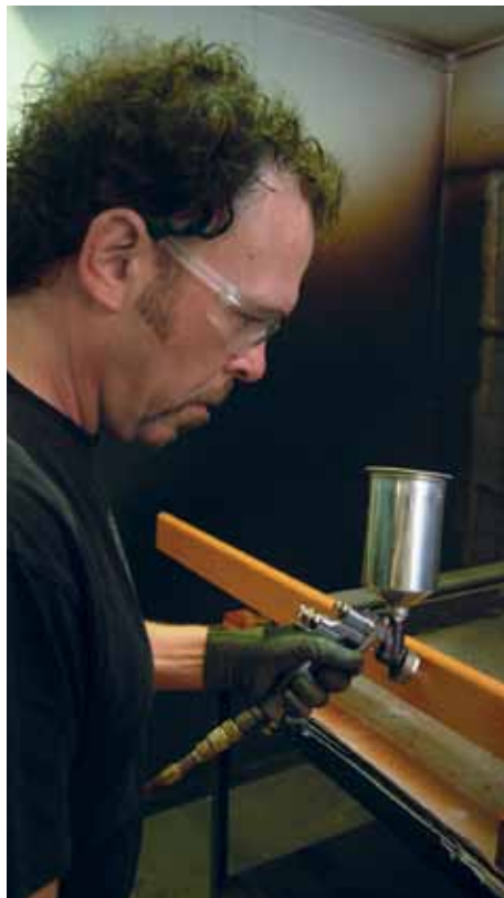
Caption can go here.

Supporting the production facility, a specialized color matching and test laboratory allows Pennwood to develop new finishes to match nearly any shade or texture of hardwood flooring with pinpoint accuracy. A fully equipped coatings test laboratory performs cosmetic and functional tests such as spectrophotometry and Taber abrasion to assure that the coated wood parts meet demanding customer requirements. New formulations are