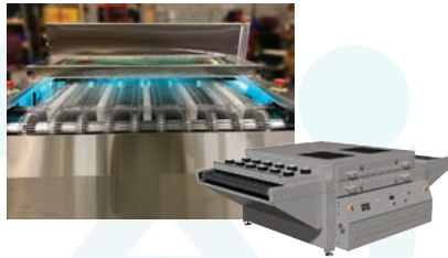
Full ConveyORIZED UVC Systems