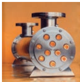
Inline Liquid UVC