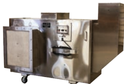
UVC Air Movers