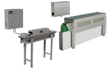
UVC Pass-Through Tunnels