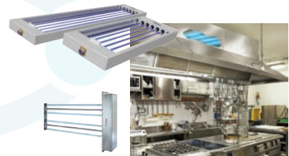
Kitchen Exhaust UVC