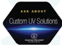
Custom UVC Solutions