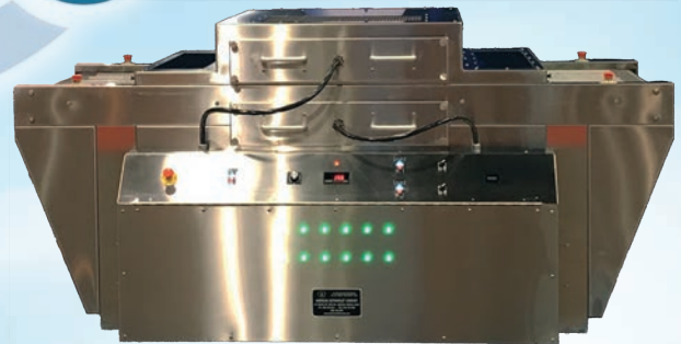
Stainless Steel UVC Conveyor for Flat Products