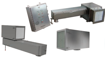
Liquid Storage Tank UVC Solutions

American Ultraviolet stands behind all our value-oriented standard and custom products. And we're very proud that our customers frequently, and consistently, let us know how our insightful solutions have led to remarkable results.