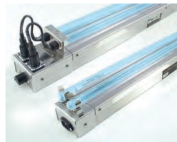
Connect multiple fixtures to one power source