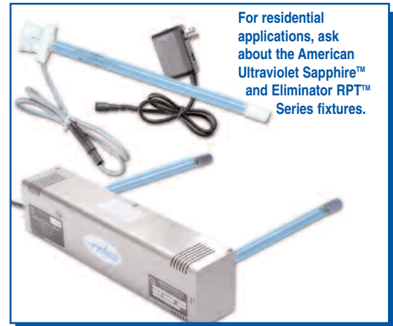
For residential applications, ask about the American Ultraviolet Sapphire™ and Eliminator RPT™ Series fixtures.