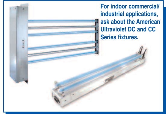
For indoor commercial/industrial applications, ask about the American Ultraviolet DC and CC Series fixtures.

INDEPENDENT TESTING: Units are tested by an independent test laboratory in accordance with the general provisions of IES Lighting Handbook, 1981 Applications Volume, and provide output per inch of glass of not less than 11.7 μW/cm 2 at 1 meter in a 400 fpm airstream of 45° F.